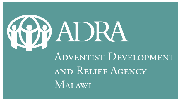
Horizontal, white, with country name 3-line horizontal logo