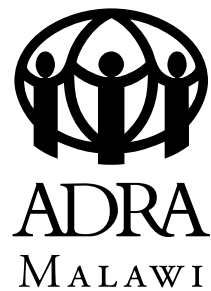
Vertical, black, with country name