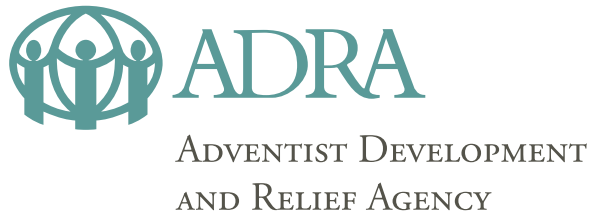
Horizontal, cmyk (cyan, magenta, yellow, black), without country name 2-line horizontal logo