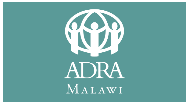
Vertical, white, with country name