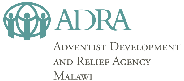
Horizontal, cmyk (cyan, magenta, yellow, black), with country name 3-line horizontal logo