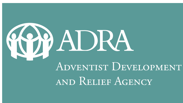
Horizontal, white, without country name 2-line horizontal logo